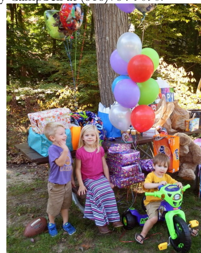
Birthday Celebrations at Westgate Park